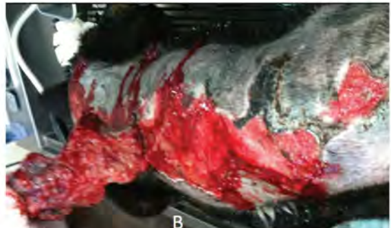
Figure 2: Necrotic tissue debrided from dorsum.

"Bubbles," a 6 year old female, spayed, black, mixed breed dog, presented to Montgomery Animal Hospital in Pineville, La., after being treated at an emergency clinic over the weekend for suspected heatstroke. The owners reported that the dog's back was painful, and her appetite was diminished.