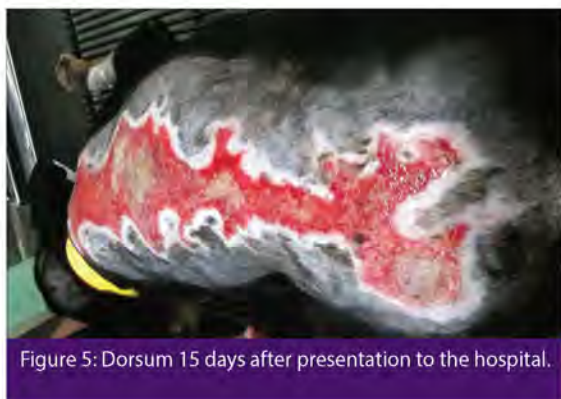
Figure 5: Dorsum 15 days after presentation to the hospital.

sterile bandages for comfort and cleanliness and to prevent secondary bacterial contamination (Figure 3). Bandage changes and PRN debridement (Figure 4) were performed every few days until her dorsal skin re-epithelialized and the wound contracted (Figure 5).