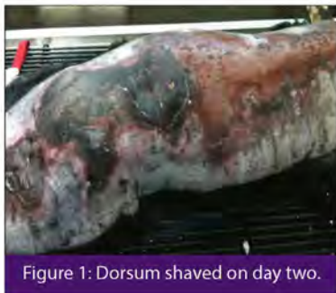
Figure 1: Dorsum shaved on day two.