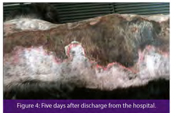
Figure 4: Five days after discharge from the hospital.